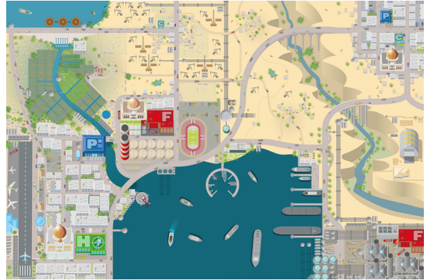
MIDDLE EASTERN COASTAL CITY MAP