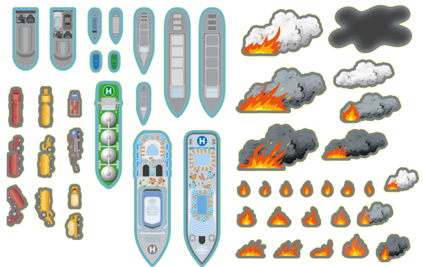
APPROPRIATE CUT-OUT VEHICLES & HAZARDS (SUPPLIED WITH ALL MAPS)