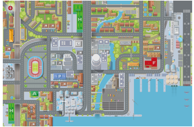
COASTAL CITY MAP