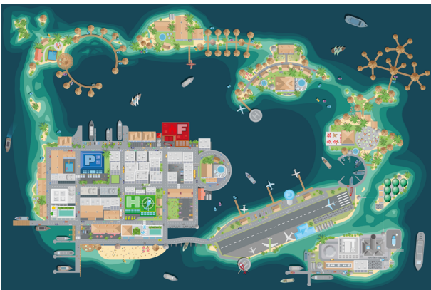
ARCHIPELAGO ISLANDS CITY MAP