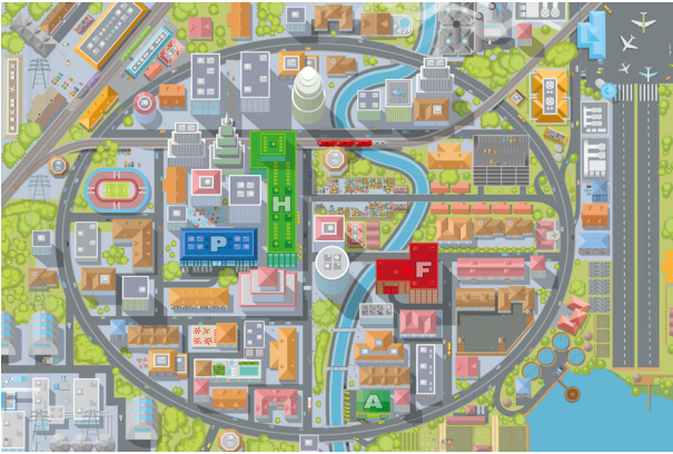
MODERN CITY MAP