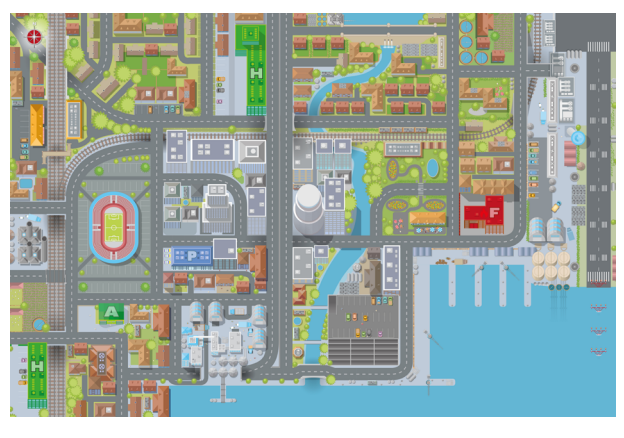
COASTAL CITY MAP