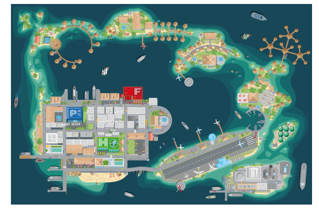
ARCHIPELAGO ISLANDS CITY MAP