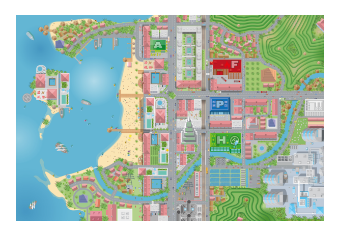
ASIAN COASTAL CITY MAP