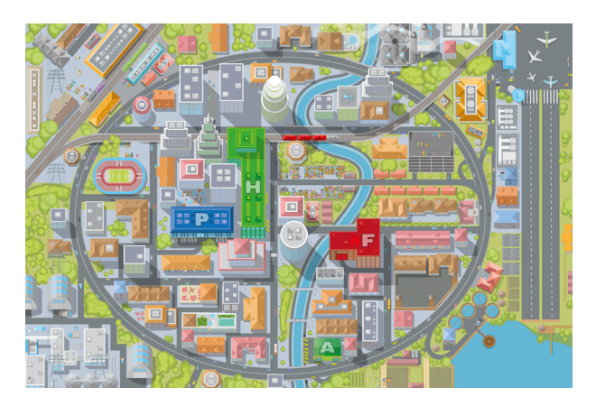
MODERN CITY MAP