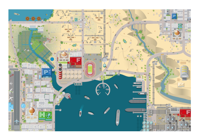
MIDDLE EASTERN COASTAL CITY MAP