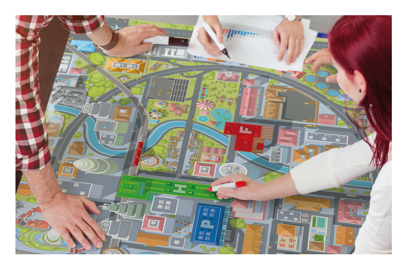
BESPOKE MAPS ALSO AVAILABLE. PLEASE CALL OR CLICK HERE TO ENQUIRE.